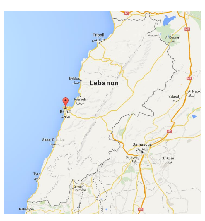
Map of Lebanon

The Lebanese economy today is suffering the consequences of longstanding development challenges and these multiples crises exacerbated further by the COVID-19 health emergency, coming at